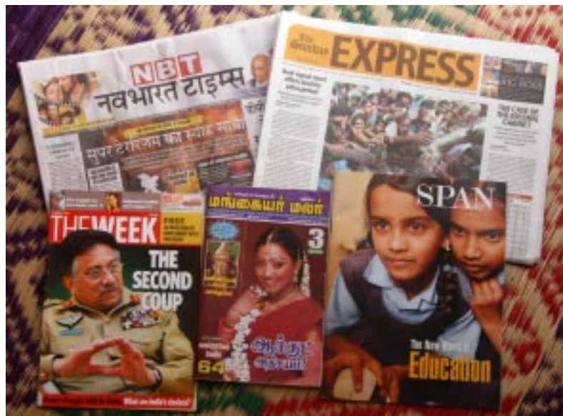
Fig. 2.4 : Print Media

Knowledge and information, which were till then the monopoly of certain sections of the upper strata of society, slowly became available to ordinary people. Spread of knowledge, available in print between two hard covers, was fast. Schools, colleges and universities were places with their libraries making books available to those who wanted to read even if they could not afford to buy them. Later newspapers and journals also became popular.